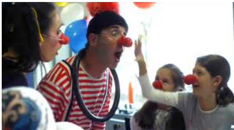
Imatge principal a portada:

Originally published by xarxanet.org , 25 october 2011