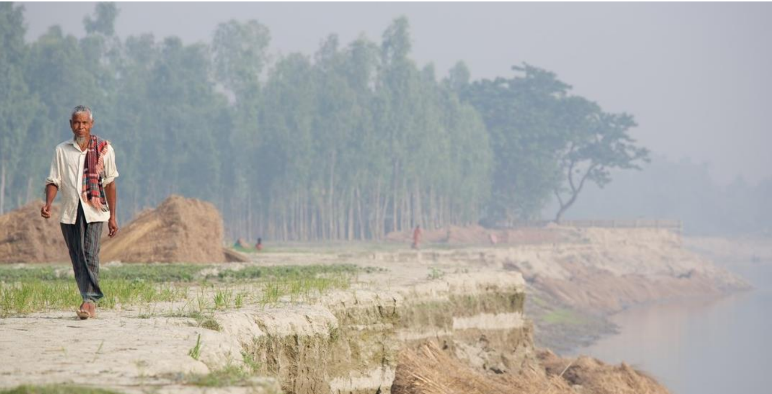
A man walks along an ever-eroding char (sand island) close to the town of Fulchuri Haat. The area is prone to seasonal flooding. Photo: Tom Pietrasik/Oxfam (2014)

Low-lying and densely populated Bangladesh is one of the most exposed countries on earth to the impacts of climate change. 48 In the coastal regions, rising seas, compounded by severe tropical cyclones and storm surges, are already displacing communities from their land and homes. 49 In mainland regions, riverbank erosion from intense monsoonal downpours is increasing the already extreme risk of flooding, leading to thousands of people becoming landless and homeless each year. 50