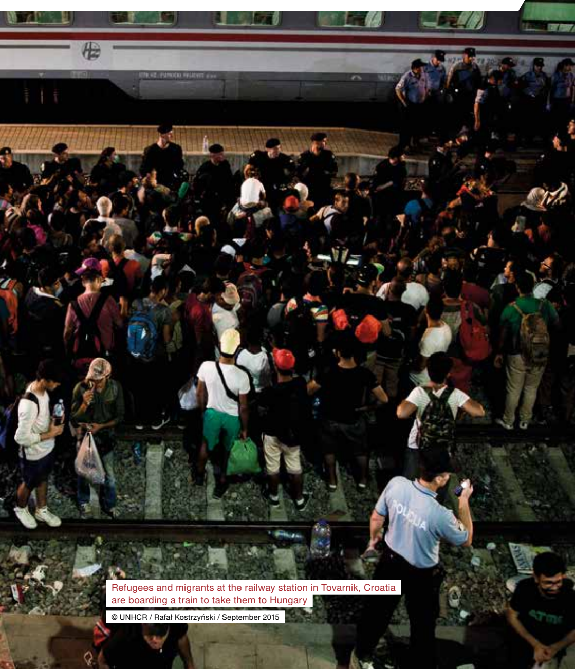
Refugees and migrants at the railway station in Tovarnik, Croatia are boarding a train to take them to Hungary

© UNHCR / Rafał Kostrzyński / September 2015